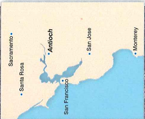
FIGURE 1 - VICINITY MAP AND FACILITIES LOCATION

CITY OF ANTIOCH BRACKISH WATER DESALINATION PROJECT